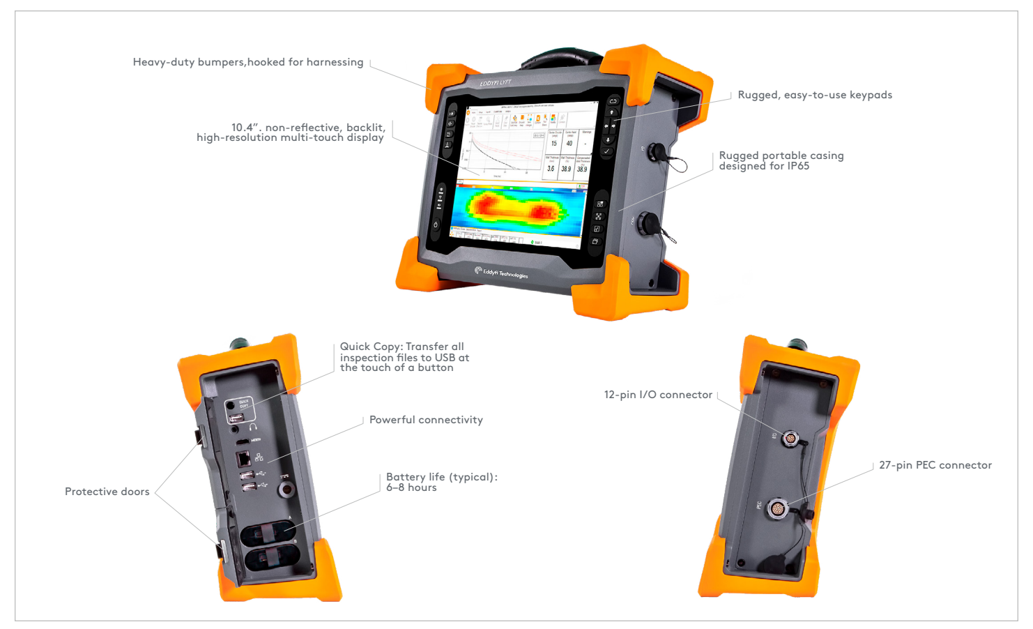
Figure 1: Annotated breakdown of Lyft showing its key features.